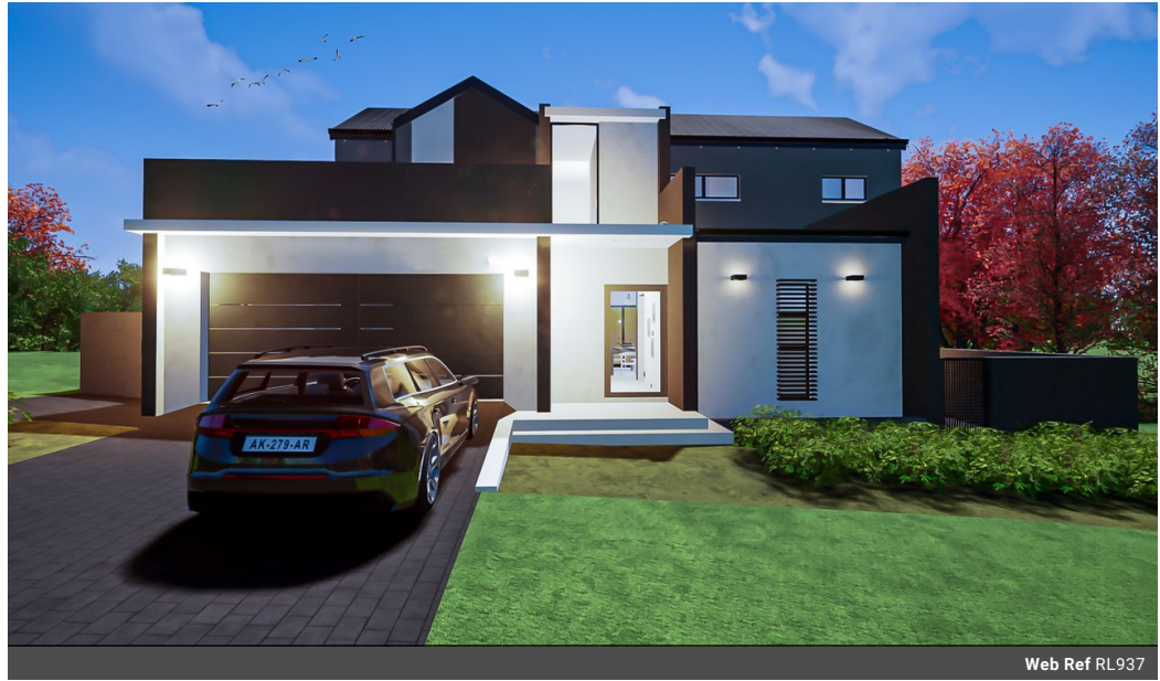
Web Ref RL937