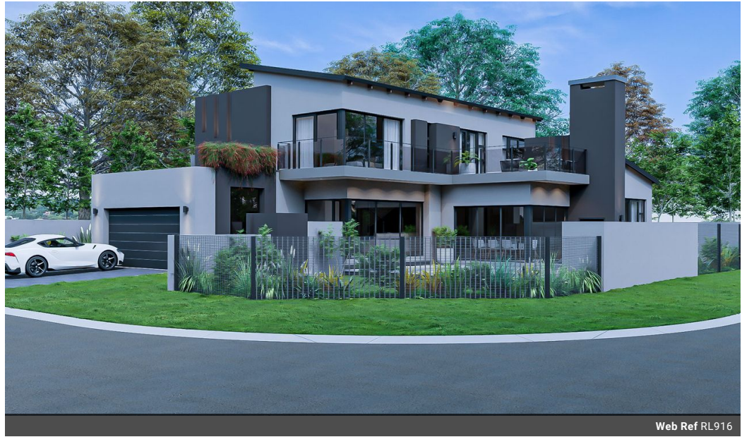
Web Ref RL916