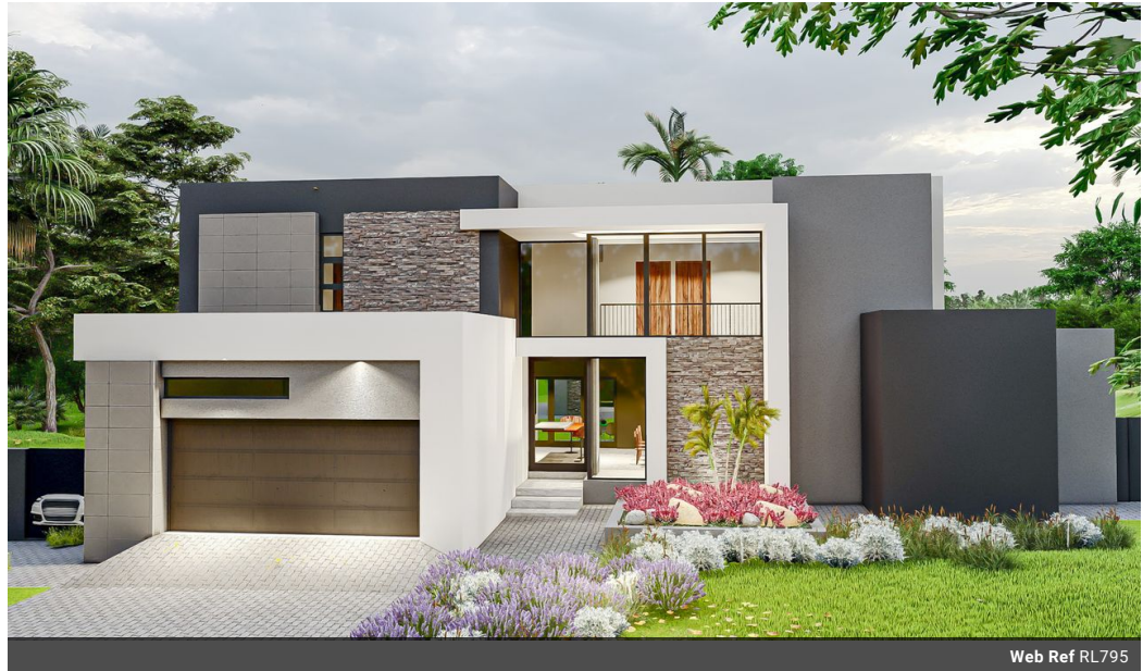
Web Ref RL795