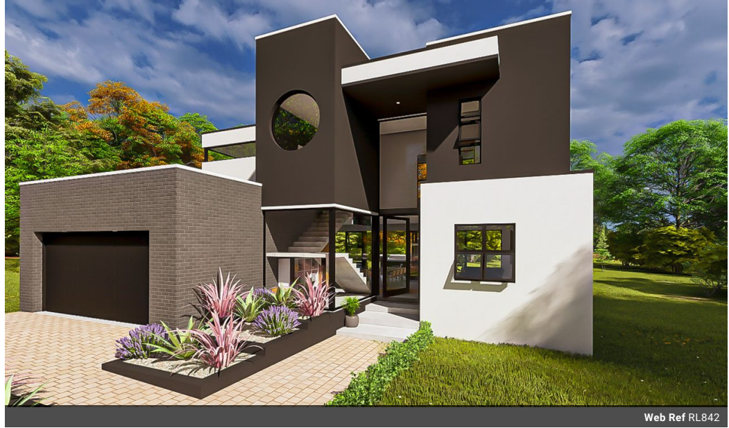
Web Ref RL842