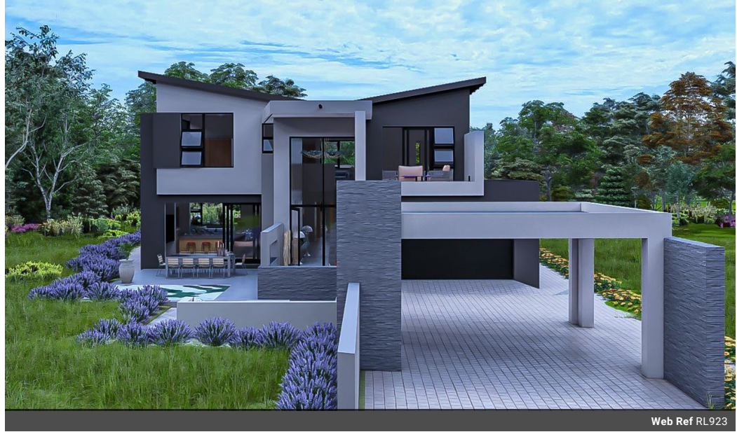
Web Ref RL923