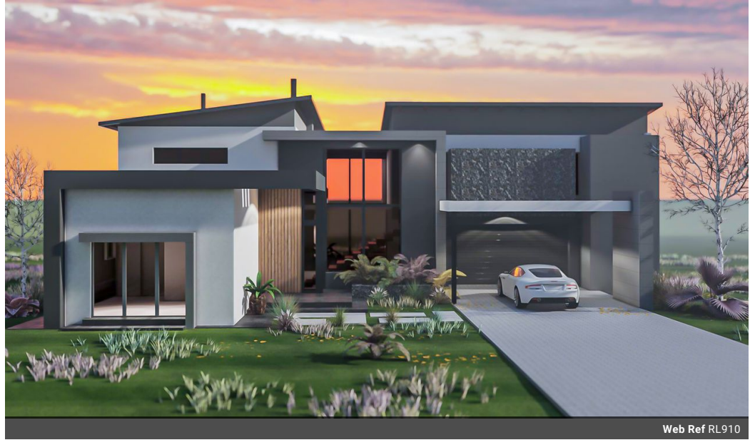
Web Ref RL910