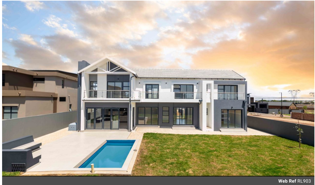
Web Ref RL903