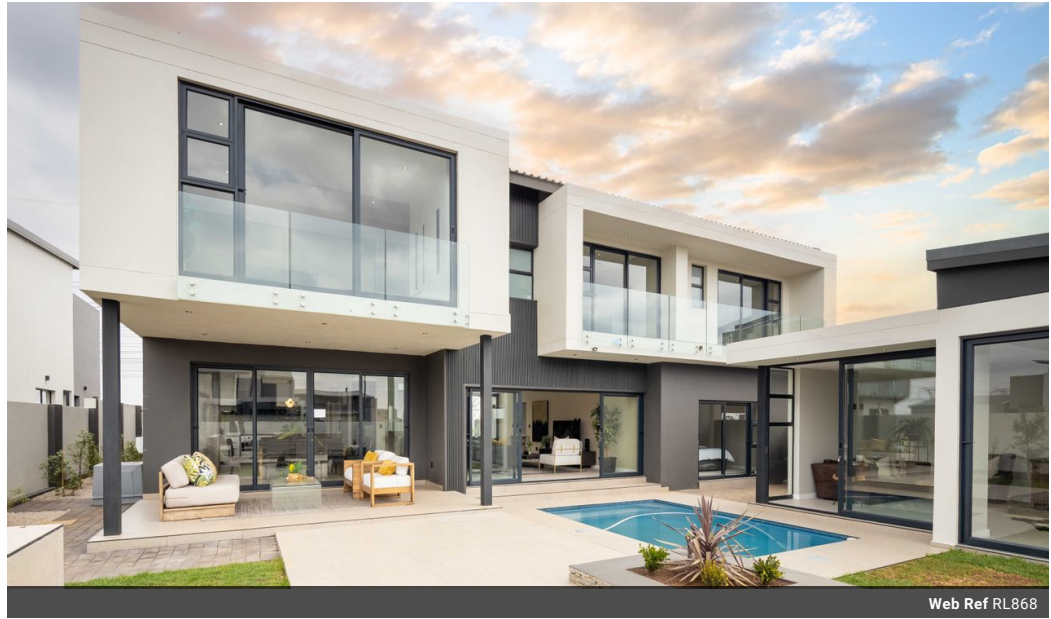
Web Ref RL868