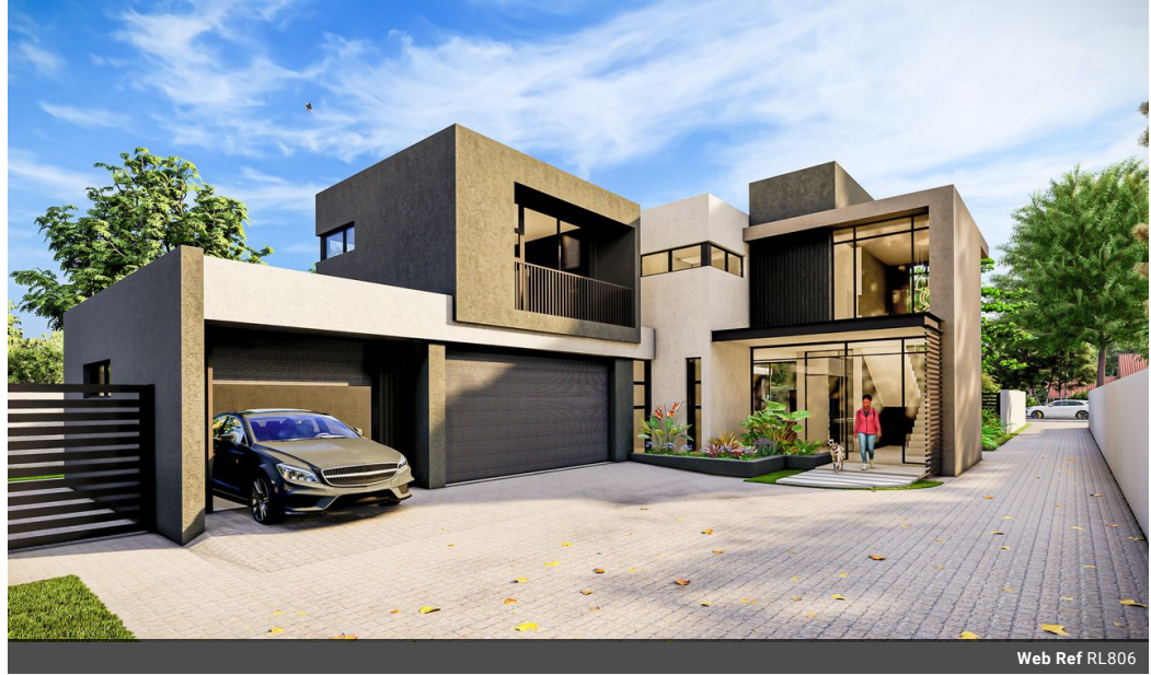
Web Ref RL806