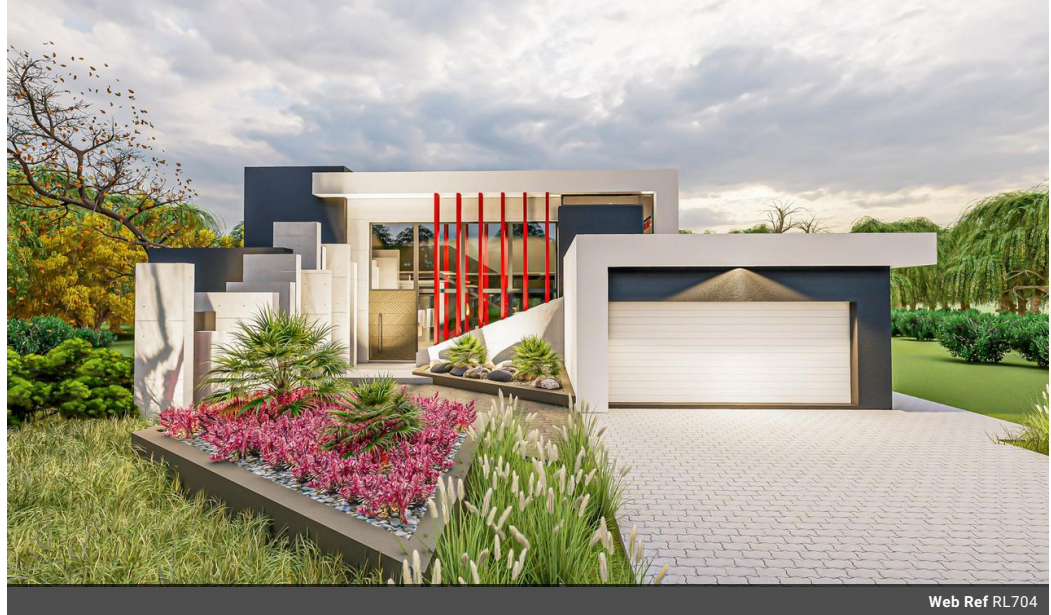
Web Ref RL704