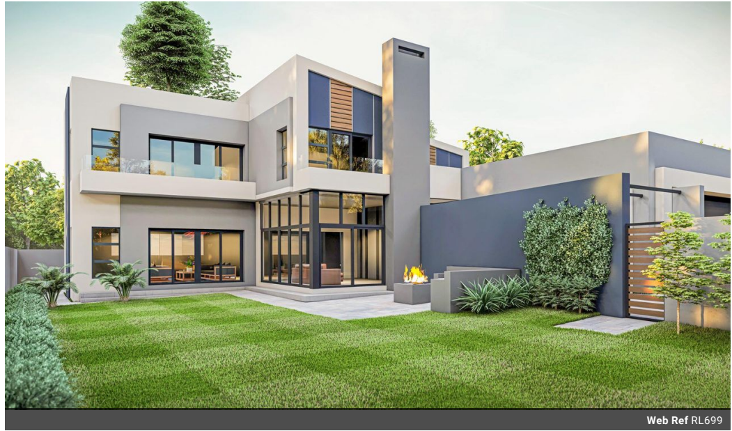
Web Ref RL699