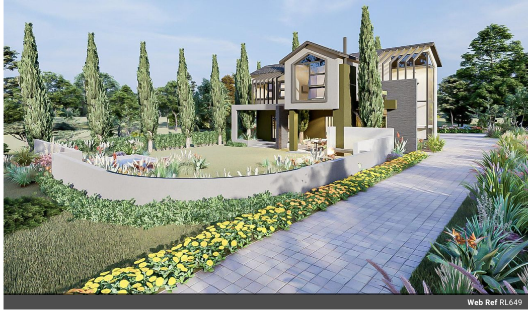
Web Ref RL649