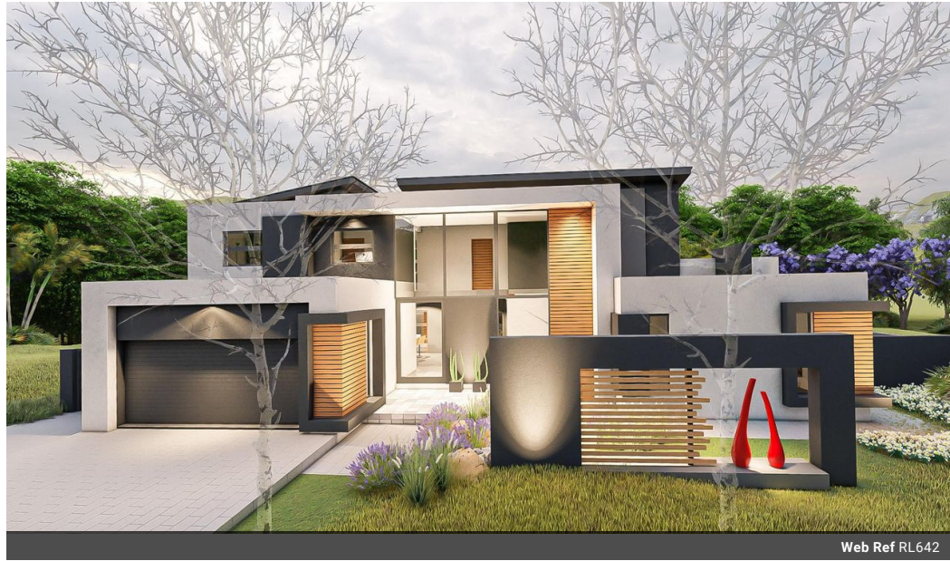
Web Ref RL642