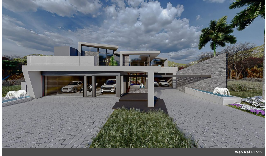
Web Ref RL529