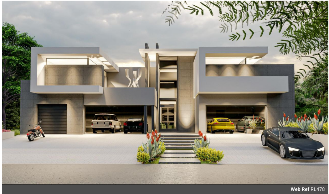
Web Ref RL478