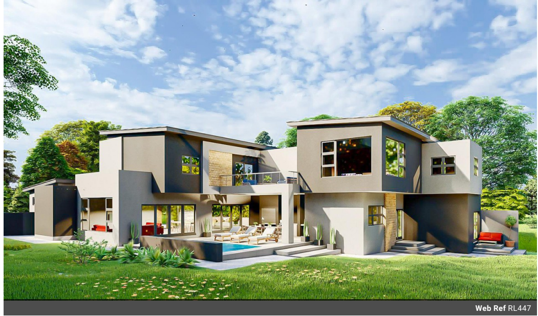
Web Ref RL447